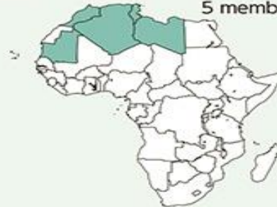
AMU (Arab Maghreb Union) 5 member countries