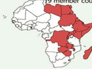
COMESA (Common Market for Eastern and Southern Africa) 19 member countries