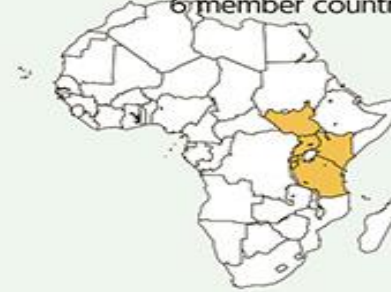
EAC (East African Community) 6 member countries