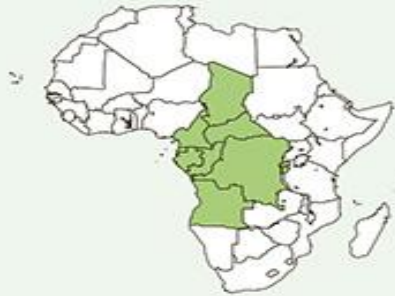
ECCAS (Economic Community of Central African States) 11 member countries