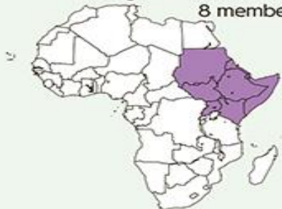
IGAD (Inter-governmental Authority on Development) 8 member countries