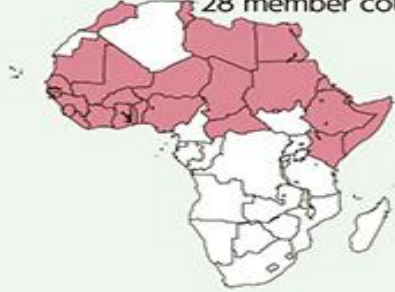
CEN-SAD (Community of Sahel Saharan States) 28 member countries